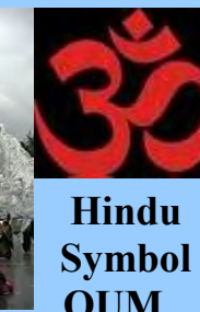
Hindu Symbol OUM