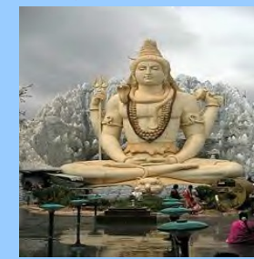
Idol of Shiva ! (the lord of yoga) performing yogic meditation (Bangalore, India)

CHOOSE THIS DAY WHOM YOU WILL SERVE !!! THE LORD JESUS CHRIST OR THE LORDS OF YOGA ???